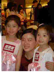
Charity Harp Marathon 2006/2007 at Harbour City